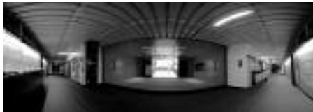
Figure 2. Panoramic picture of the portal powerwall showing the projection screen integrated into the building.

This portal is located in a public space, and is integrated architecturally into the building. The powerwall provides us with feedback from students and faculty, and proves that immersive installations can be deployed to a larger public.