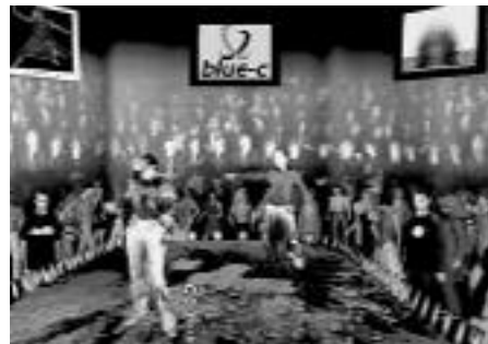
Figure 6. Screenshot: FashionShow. The user experiences herself on a virtual catwalk in real-time.

To demonstrate the functionalities and possibilities of our framework, the application FashionShow has been developed. We designed a virtual architecture (Maher, Simoff, Gu and Lau, 2000) where the users experience the immersion and stereoscopic depth of the system. Digital architectural models are enriched with textures, billboards, images, animations, movies and 3D