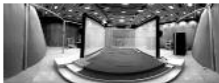
Figure 1. Panoramic picture of the portal cave showing the three projection screens in transparent mode located in the server space of the ETH Zurich.

The cave (Figure 1) is located at the Department of Computer Science at ETH-Center. It consists of a three-sided CAVETM-like spatially immersive display which allows for real-time acquisition and rendering through the projection walls as well as for real-time communication to